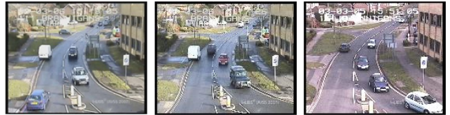
Figure 1. Surveillance Video of a CCTV

Recent technology development coupled together with peoples' concern for safety and security have caused a wide spread application of Closed Circuit Television (CCTV). These cameras provide a sense of security through its constant monitoring of the installed spatial locations. As a consequence of constant monitoring these cameras produce large amount of video data sets which, without further processing would consume a lot of manual labour to detect any anomaly experienced [3]. An example of a video footage being generated is shown in Fig. 1. In literature, there are several analysis algorithms reported for extracting semantics from such surveillance footage.